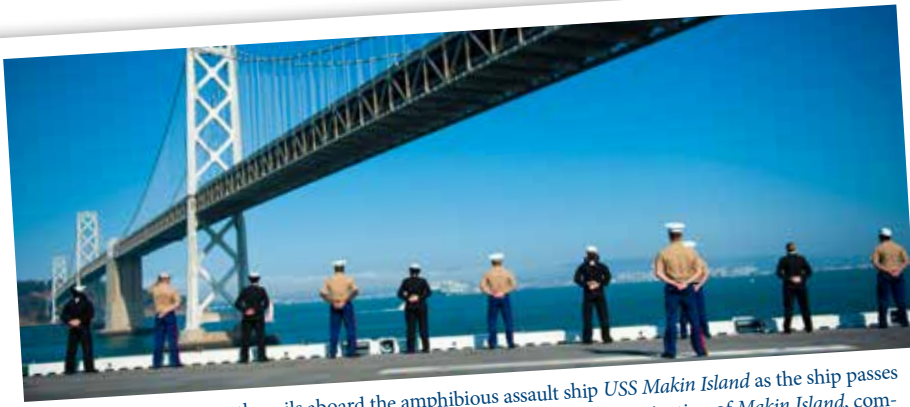
Sailors and Marines man the rails aboard the amphibious assault ship USS Makin Island as the ship passes under the Bay Bridge en route to San Francisco Fleet Week 2012. The participation of Makin Island , commanded by NPS alumnus Capt. Cedric Pringle, was just one example of the many ways members of the NPS community contributed to Fleet Week festivities.

Vice Adm. Scott H. Swift, Commander, U.S. 7th Fleet, discusses strategy with NPS faculty during a visit to the university, Oct. 18. Swift met with several campus leaders and faculty, and attended briefings from multiple departments, discussing relevant national defense issues.