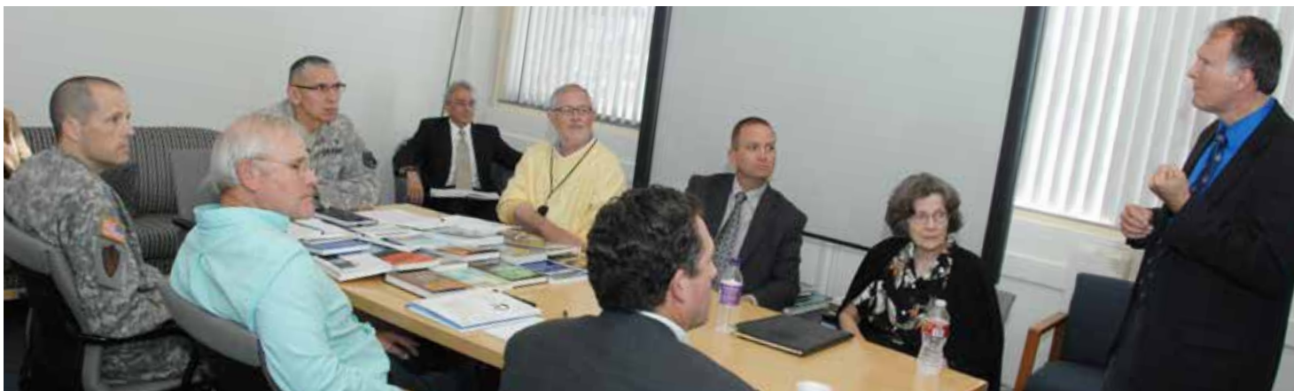
NPS faculty brief Commanding General of U.S. Army Cyber Command/U.S. 2nd Army Lt. Gen. Rhett A. Hernandez.