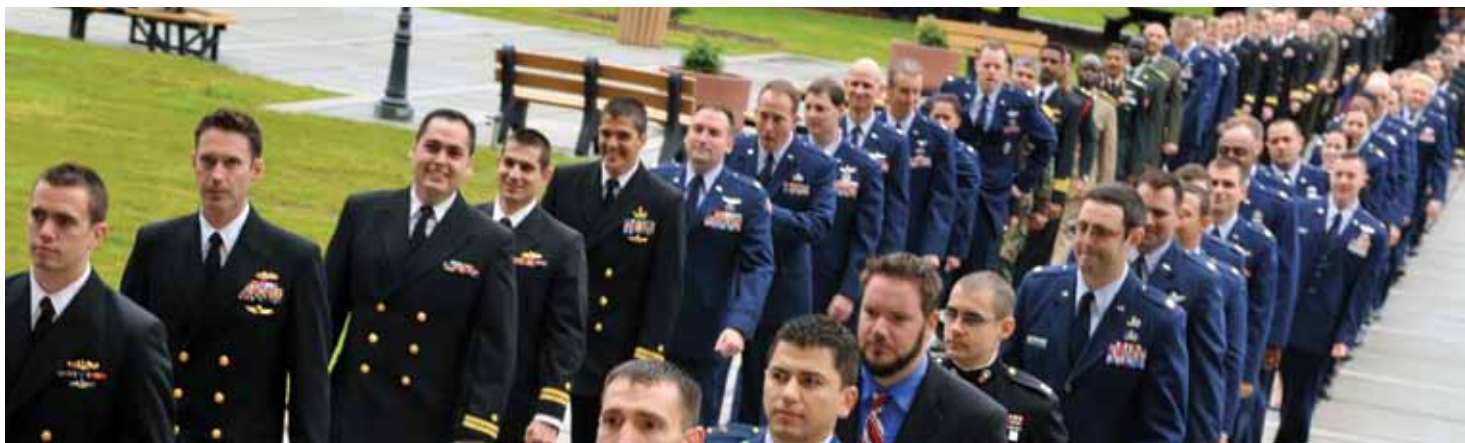
NPS students line up in preparation to enter King Auditorium for Fall 2010 graduation ceremonies.