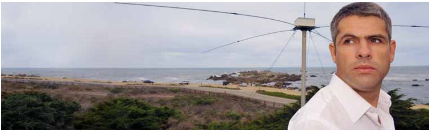
NPS Oceanography student, Portuguese Navy Lt. Ricardo Vicente, stands beside one of NPS' high-frequency radar systems.