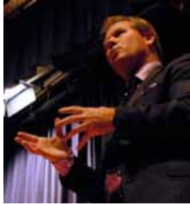
Dr. David Kilcullen, noted architect of the surge in Iraq in 2007, speaks to NPS students, faculty and staff, Aug. 16.

Kilcullen gave first-hand insights into the topic of counterinsurgency — ranging from its historical background to its current state — and offered ideas for solving the challenges of the ever-evolving form of warfare.