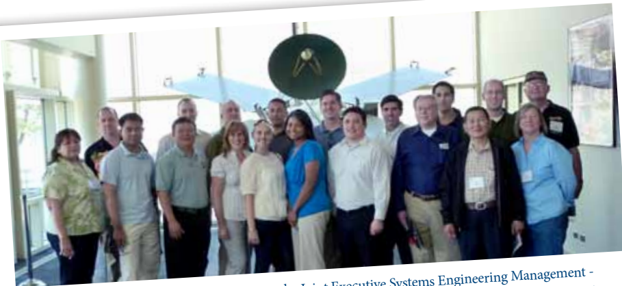
A cohort of NPS distance learning students in the Joint Executive Systems Engineering Management - Product Development Leadership Education for the 21st Century, gathered from around the country to attend this year's INCOSE International Symposium in Denver, Colo.