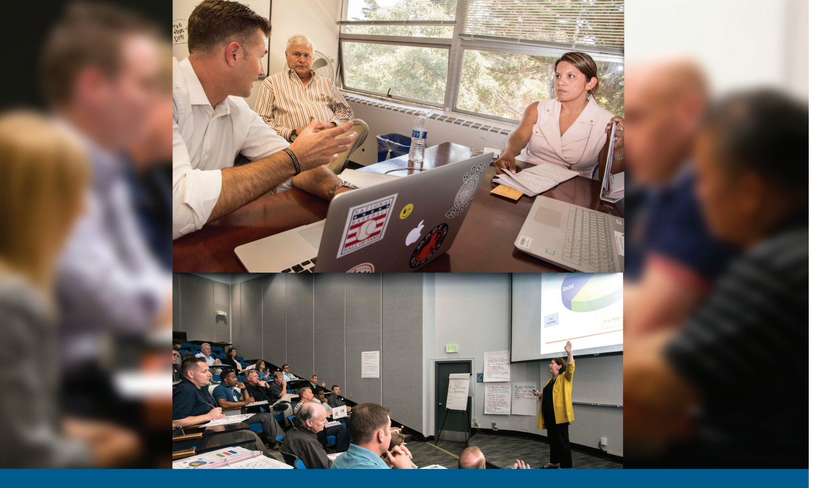
From communication to innovation, leadership development to strategic alignment, the Naval Postgraduate School Center for Executive Education's lineup has evolved into a broad portfolio of executive development programs tailored to meet the unique needs of the U.S. Navy and Department of Defense.