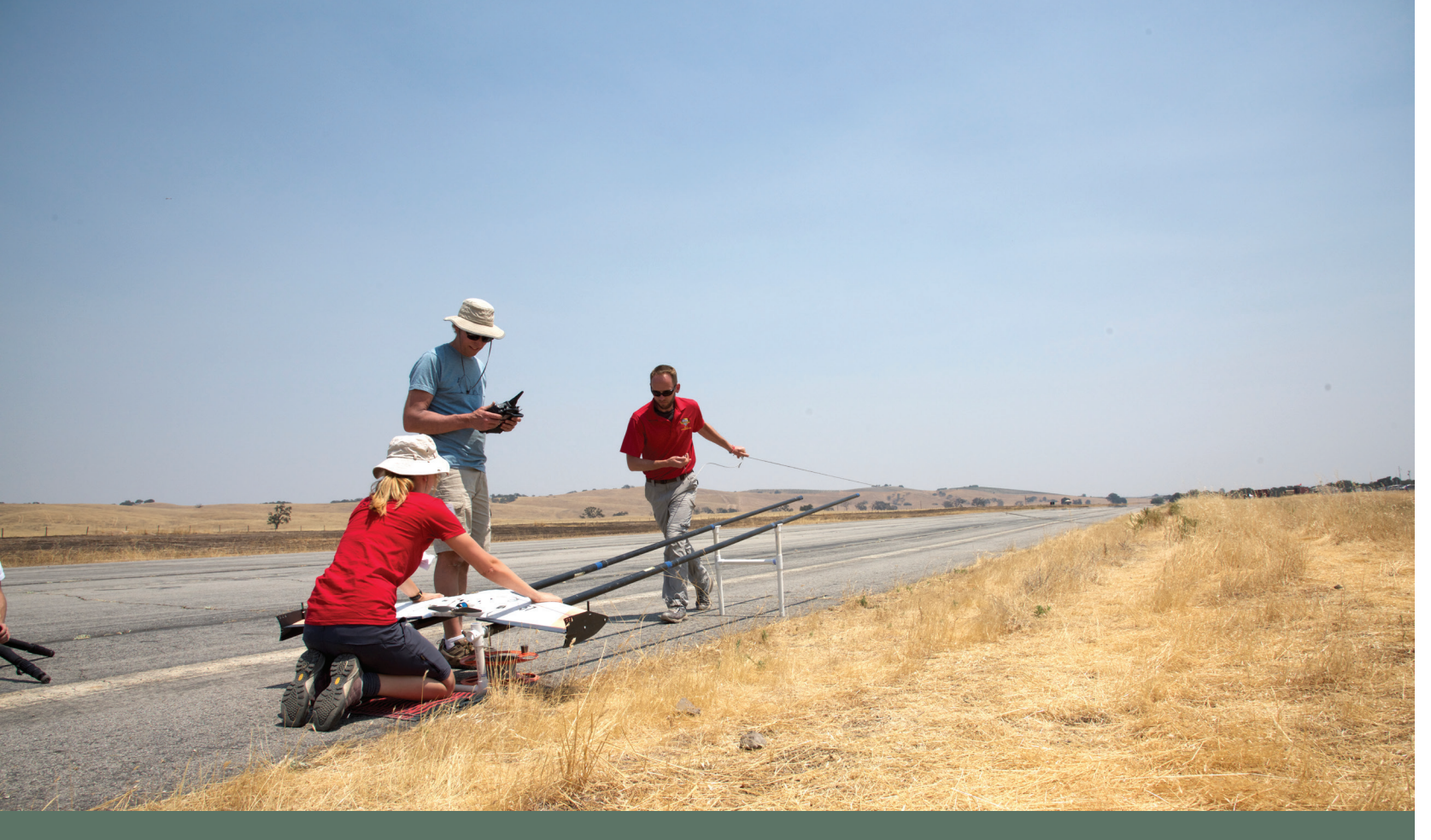
A team of NPS researchers prepares to launch an unmanned aerial vehicle during an experiment in swarming unmanned systems at the latest Joint Interagency Field Experimentation (JIFX) program. JIFX provides academic, industry and military representatives with an environment to sandbox emerging technologies.