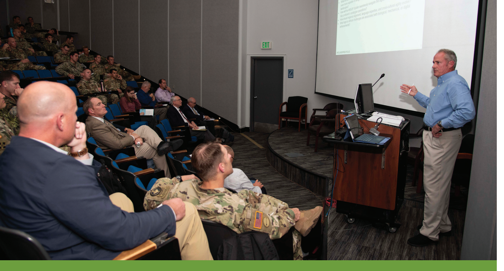
Students and faculty attend one of several command representative briefs during the NPS Defense Analysis department's Research Week event in late August. The event provides an opportunity for a stronger connection between the needs of the operational force, and the research of DA students and faculty.