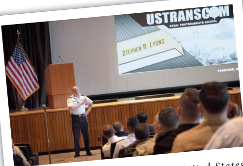
Gen. Steve Lyons, Commander, United States Transportation Command, and an NPS alumnus, shared his insights on the global logistics behind U.S. power projection during the latest NPS Secretary of the Navy Guest Lecture in King Hall, July 23..