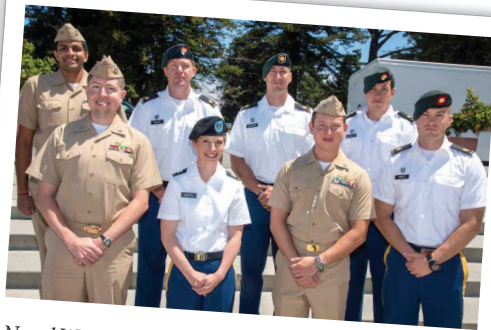
Naval War College students graduating with distinction pose for a group photo, July 23. Through the NPS-NWC partnership, a total of 5,369 officers have earned their JPME Phase I certification since the program's inception in September 1999.