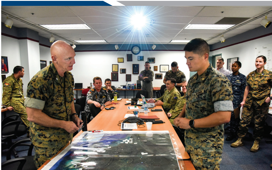
A diverse team of NPS students executes a sponsored wargame on a multi-domain task force at the request of U.S. Army Pacific during Wargaming Week. The effort represents the culmination of their studies in the operations research department's wargaming applications course.

Although the eight wargame scenarios differed, they all took place in the INDO-PACOM AOR. In the Navy's Small Combatant Flotilla wargame, Hughes himself took the helm as the blue forces commander tasked with delivering supplies from Guam to the area of operations.