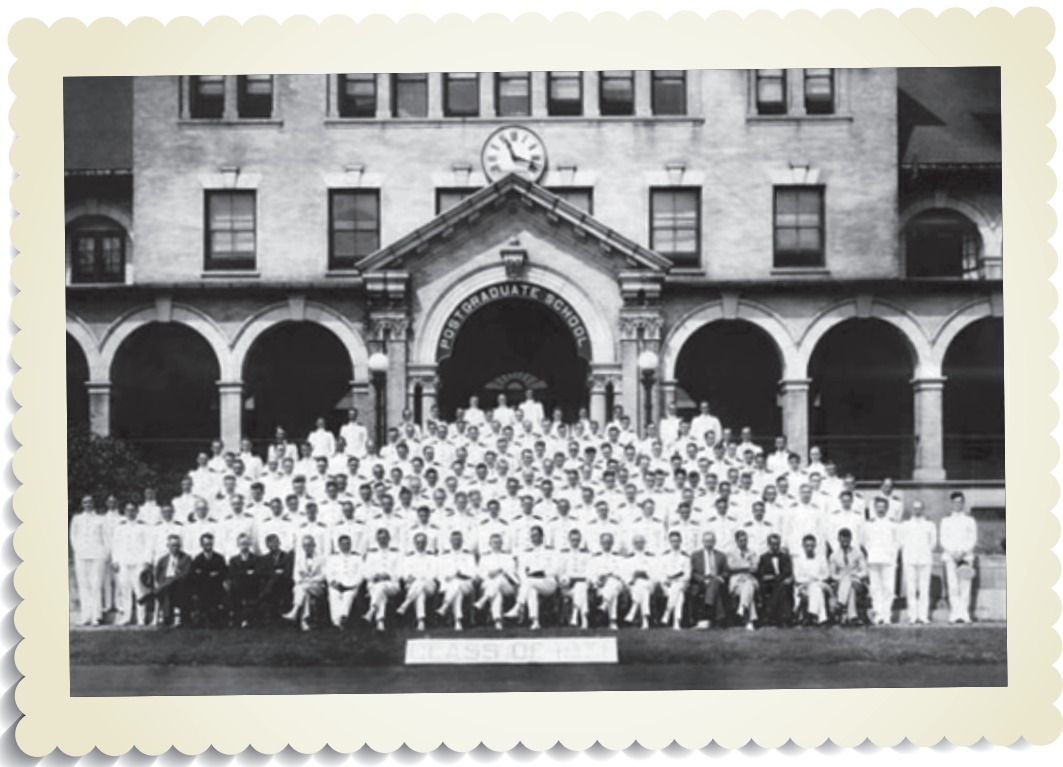
U.S. Naval Postgraduate School, Annapolis, Maryland, 1931