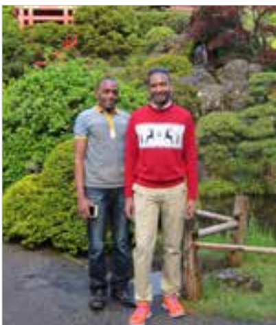
IDMC 17-2 at San Francisco's Japanese Tea Gardens