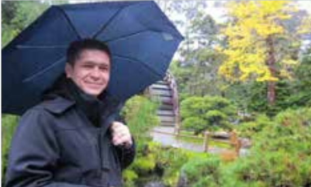
IDMC 17-1 at San Francisco's Japanese Tea Gardens