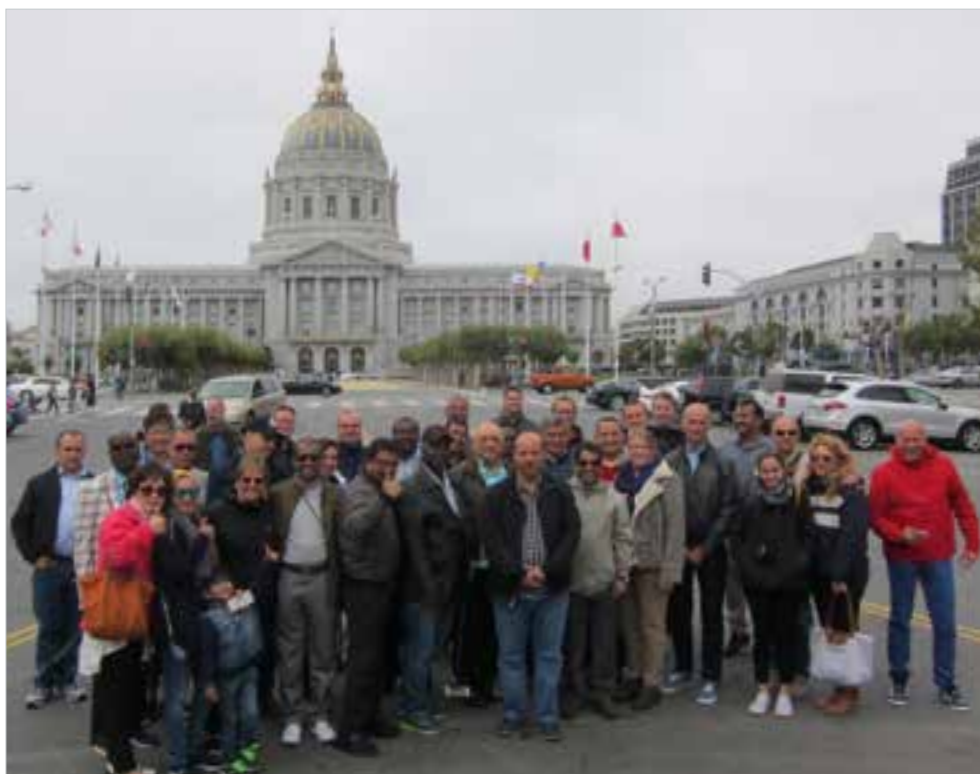
SIDMC 2016 participants at San Francisco City Hall

participants in August. We hope that our participants enjoy being in the course as much as our faculty enjoy interacting with and teaching our participants. ■