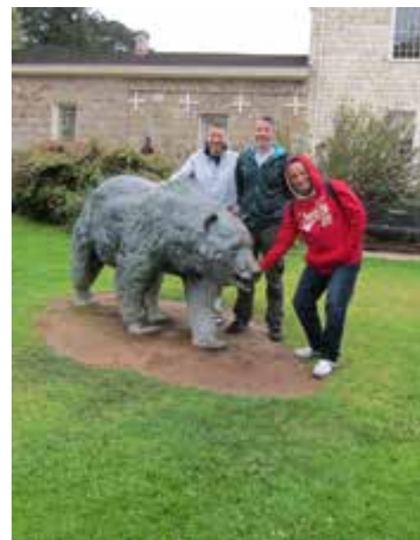
SIDMC 2016 participants outside of Colton Hall in Monterey

DRMI faculty also hosted a closing reception for SIDMC participants the day before graduation. DRMI faculty look forward to welcoming SIDMC 2017