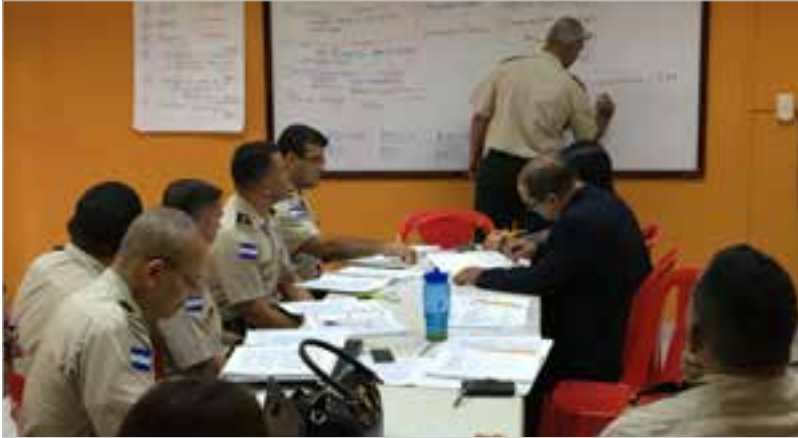
MIDMC – Honduras