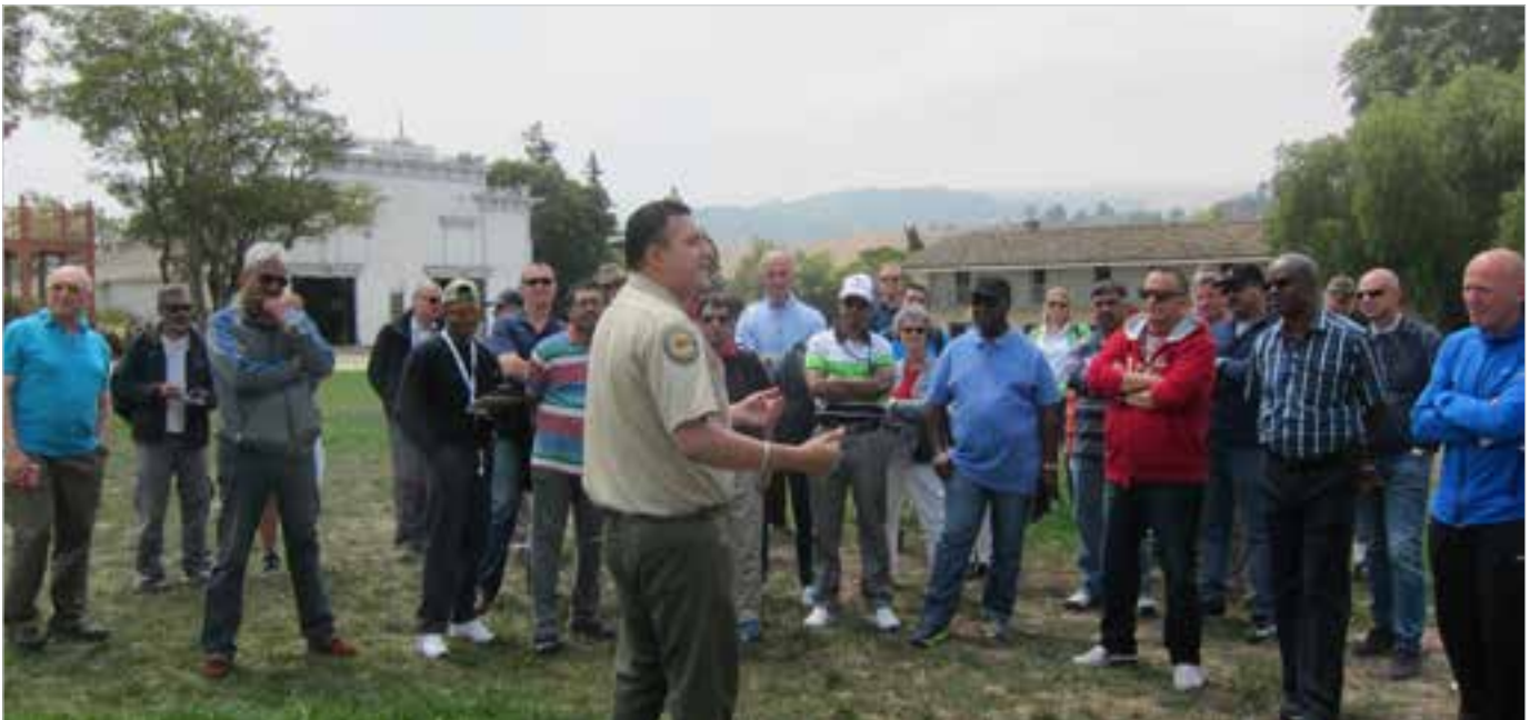
SIDMC 2016 participants in San Juan Bautista