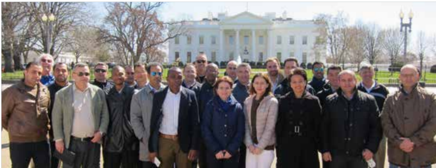
IDMC 17-2 at the White House

Throughout the trip, participants marveled at their experiences: diamonds at the Museum of Natural History, the Wright Brother's plane at the National Air & Space Museum, the Declaration of Independence at the National Archives, the Library of Congress, Arlington National Cemetery, and trips to Tyson's Corner and Old