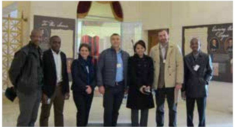
IDMC 17-2 at the U.S. Supreme Court