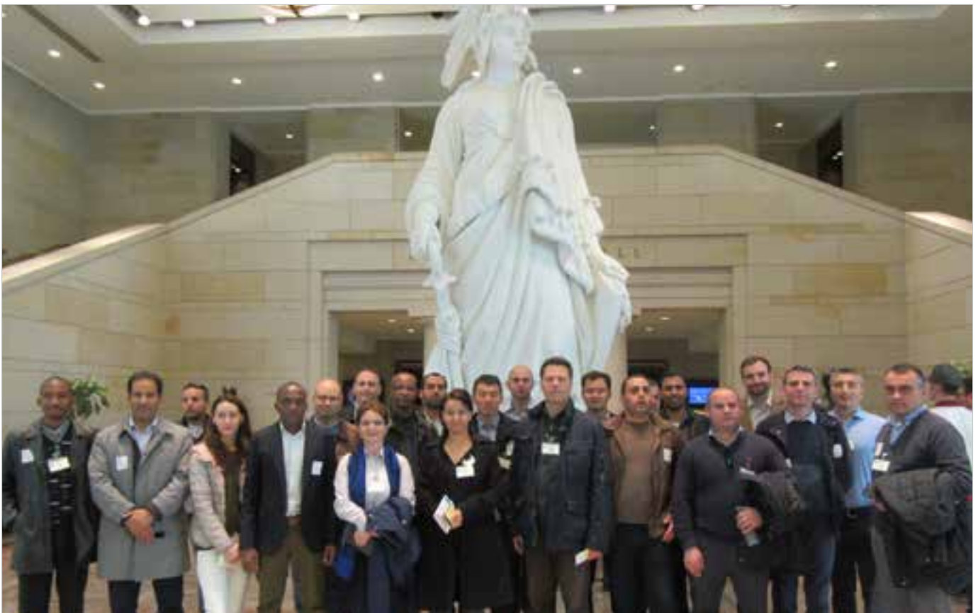
IDMC 17-2 at Capitol Visitors Center in D.C.