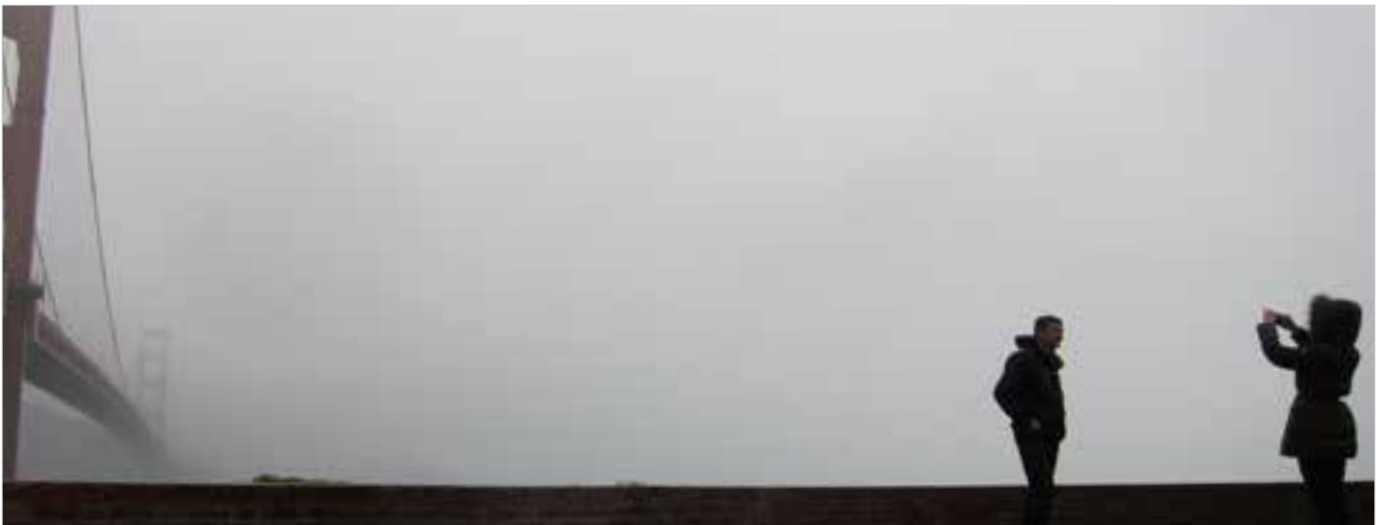
IDMC 17-1 at Golden Gate Bridge