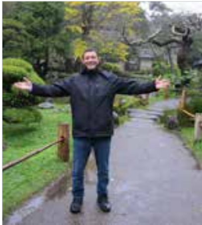
IDMC 17-1 at San Francisco's Japanese Tea Gardens