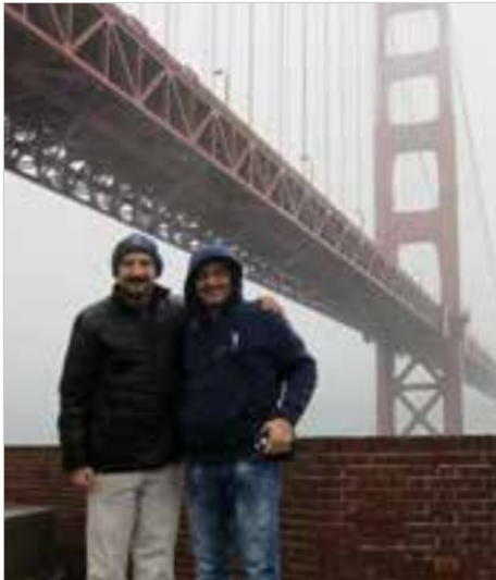
IDMC 17-1 at the Golden Gate Bridge

While this weather was unexpected for a California visit, the international participants persevered and showed their resilience. Their collaborative efforts and sense of comradery deepened in spite of the unusual weather.