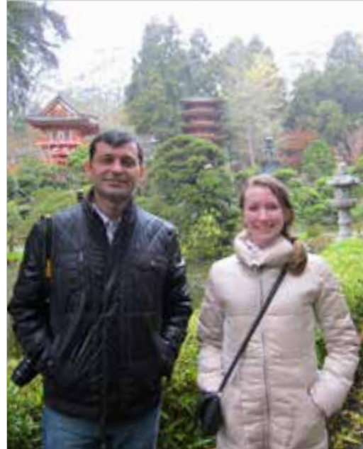
IDMC 17-1 at San Francisco's Japanese Tea Gardens