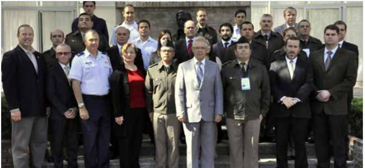
MIDMC – Uruguay with honored guest and closing speaker, Jorge Menendez Corte, Uruguay's Minister of National Defense (front row, gray suit)