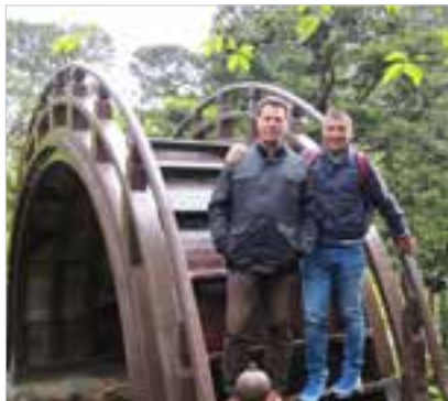
IDMC 17-2 participants at San Francisco's Japanese Tea Gardens