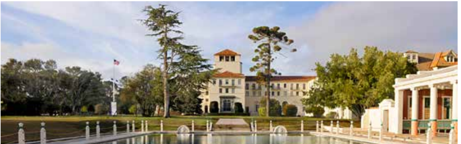
Herrmann Hall at the Naval Postgraduate School, Monterey, California

Desktop Publishing: Center for Educational Design, Development, and Distribution (CED3)