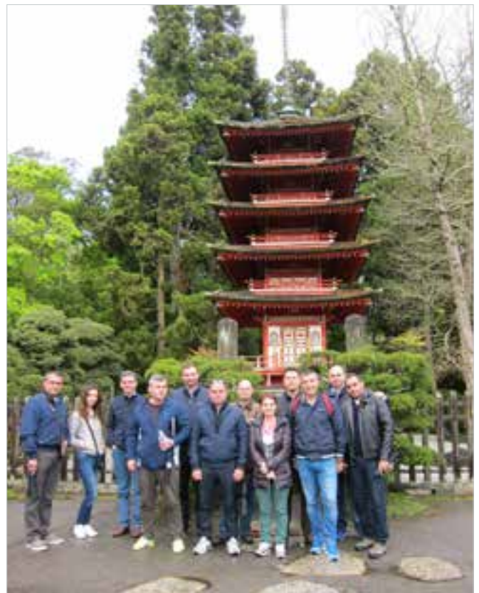
IDMC 17-2 at San Francisco's Japanese Tea Gardens