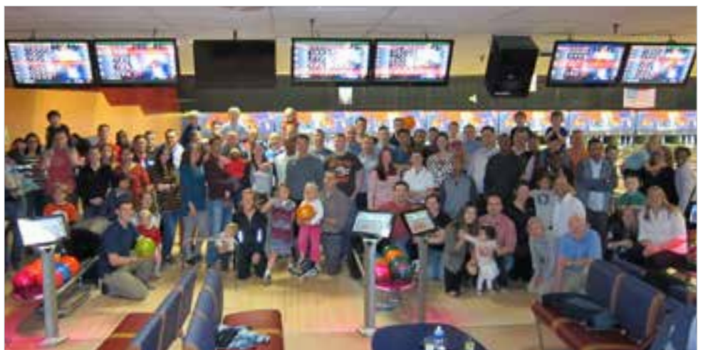
IDMC 17-2 FAO-CAP security cooperation and team building event