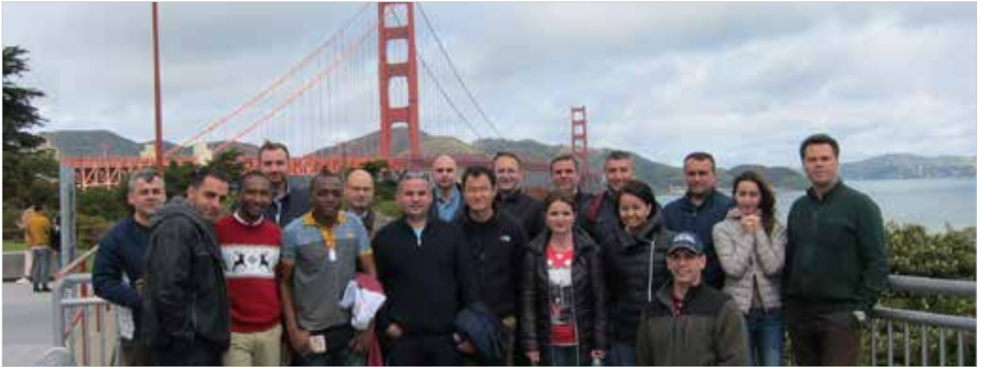
IDMC 17-2 at Golden Gate Bridge