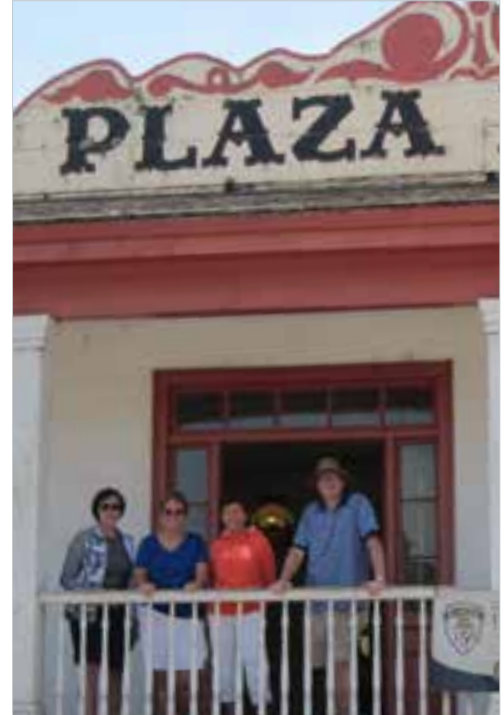
SIDMC 2016 in San Juan Bautista