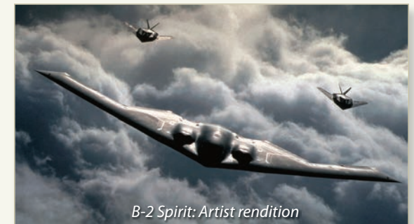
B-2 Spirit: Artist rendition