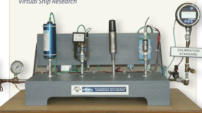
Virtual Ship Research