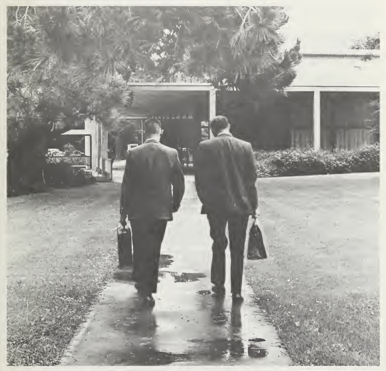
Approach to King Hall