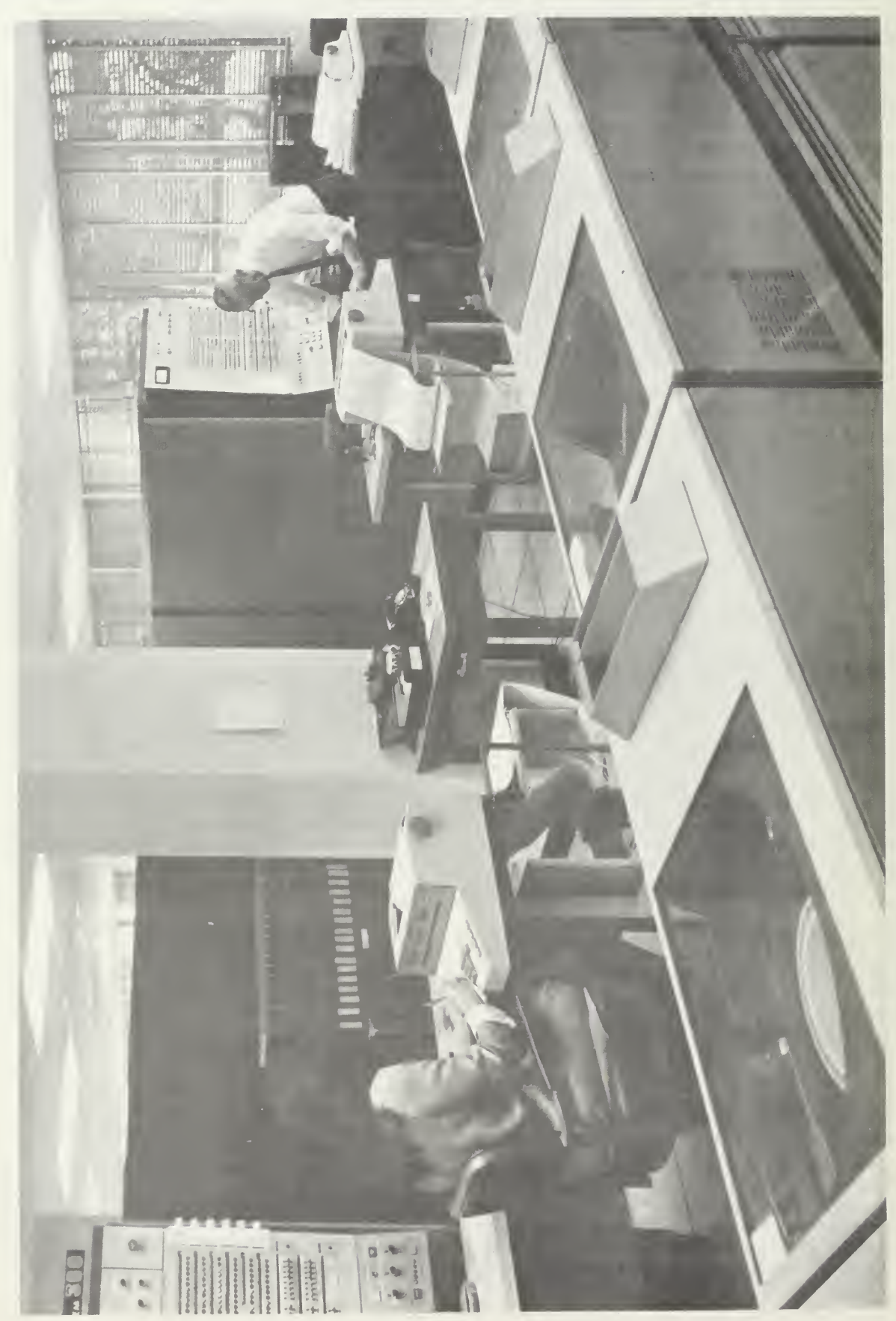
IBM 360/67 computer system in the Computer Center.