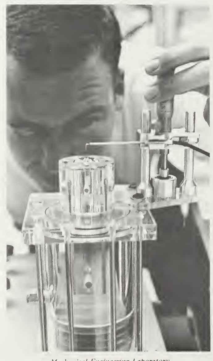
Mechanical Engineering Laboratory