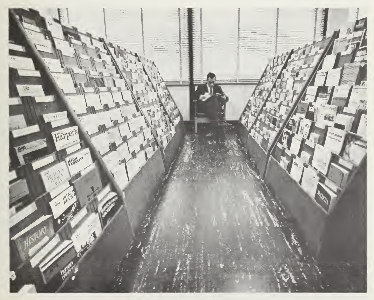
Library Periodical Room