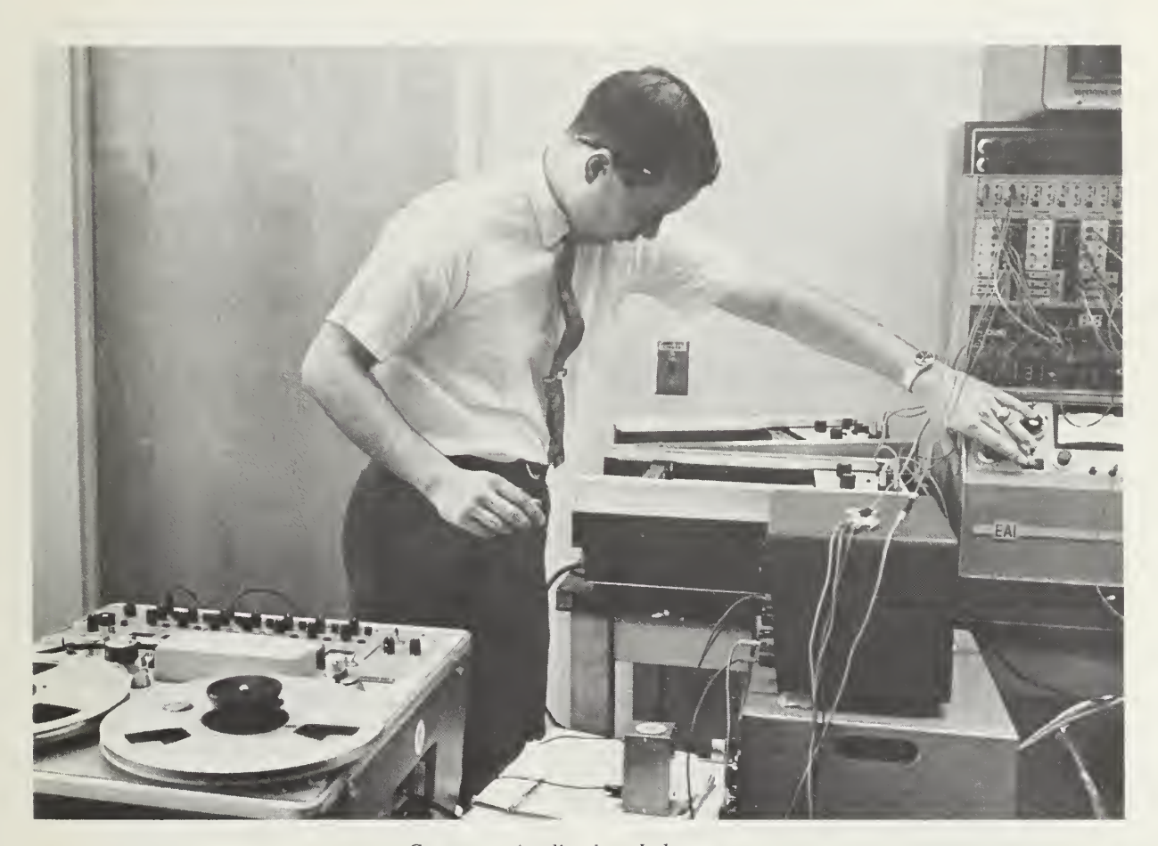
Computer Applications Laboratory

Selected Naval Academy, NROTC, and OCS graduates may enter directly into a graduate program and obtain a Master's degree upon completion of four quarters course work, including an acceptable thesis.