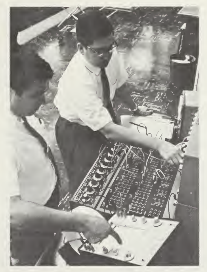
Analog Computer Laboratory