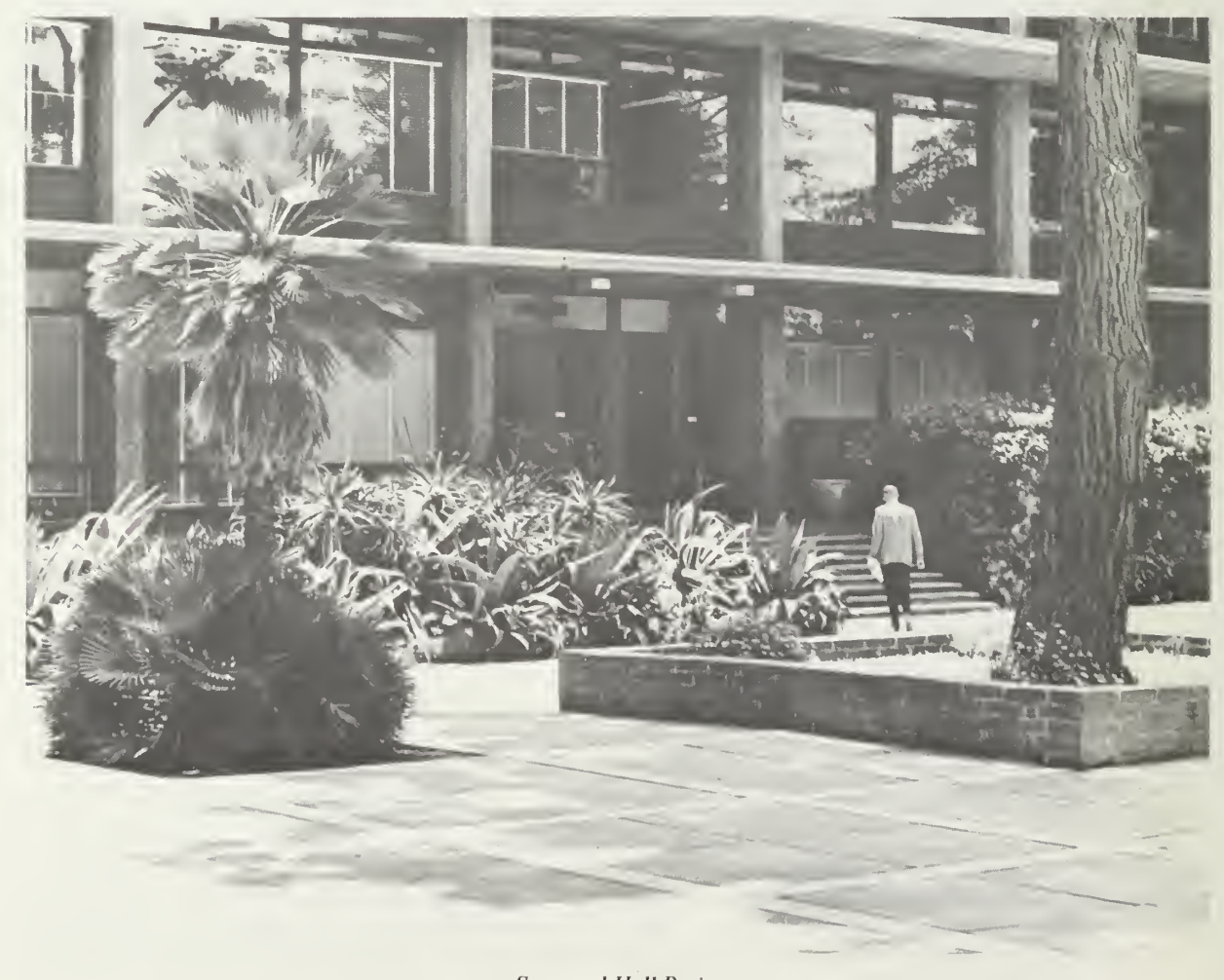
Spanagel Hall Patio