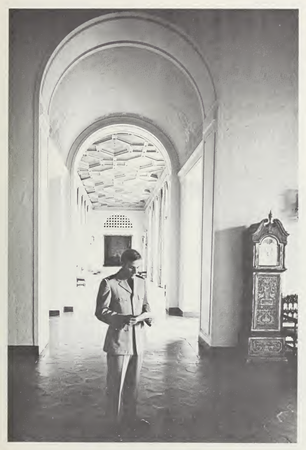
Lobby of Administration Building