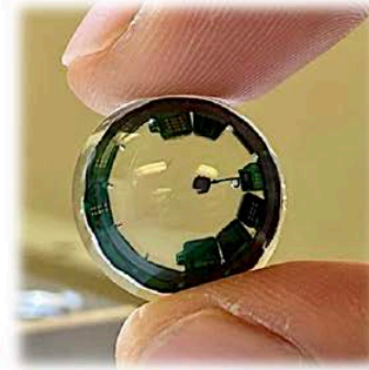
Current Prototype Lens

Tectus Corporation is developing the world's first and only augmented reality (AR) contact lens. Unlike awkward, bulky, and heavy AR goggles and headsets, our technology overlays images, symbols, and text on the real world without obstructing vision, limiting mobility or interfering with productivity. These comfortable contact lenses can be worn all day, are inconspicuous, will display as much or as little information as needed, and with our UX, the user can select what they want to see or do using only their eyes – hands free!