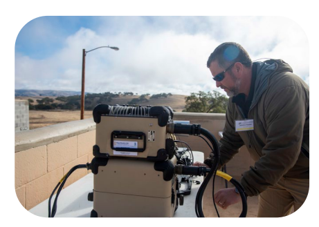
K-03: Bren-Tronics set up their austere battery packs for uninterrupted power.