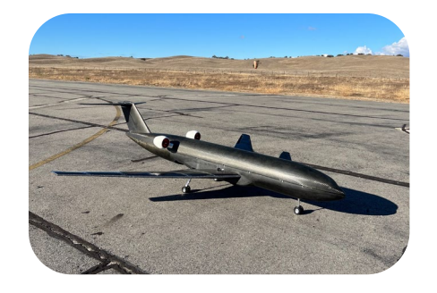
A-04: M4 Engineering, Inc experimented on their all-electric subscale remotely-piloted flight test vehicle.