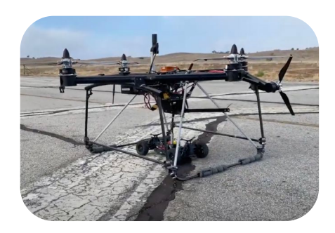
A-05: Toofon tested payload delivery by carrying a small UGV on their long-range, heavy-lift vehicle.