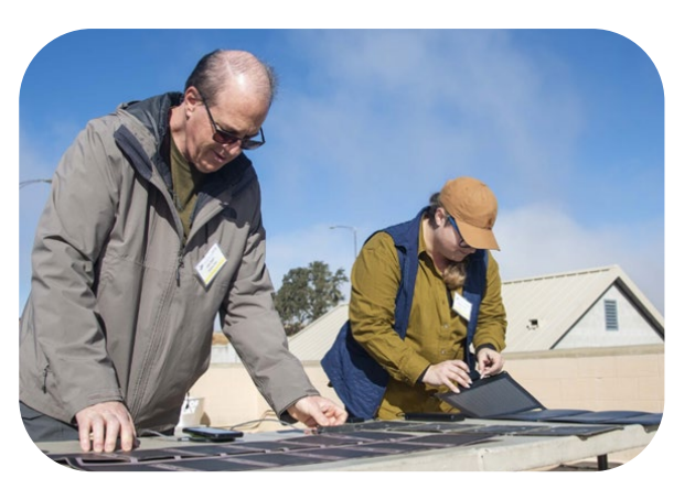
F-01: Ascent Solar readies their compact, flexible solar arrays for a collaborative experiment.