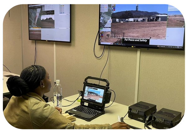
Members of 820<sup>th</sup> Base Defense Group put various systems through their paces as they explore capabilities for INDOPACOM applications.