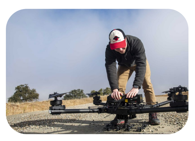
E-02: Ravenworks prepares one of its UAS for flight.