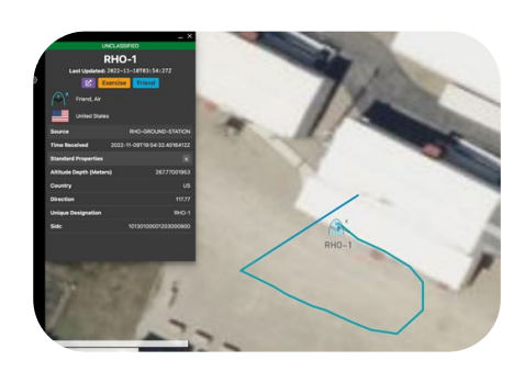
G-01: MITRE MIAD-C2 is a Cloud based Situational Awareness platform that displayed and databased A-07 Rhoman Aerospace's telemetry data for analysis.