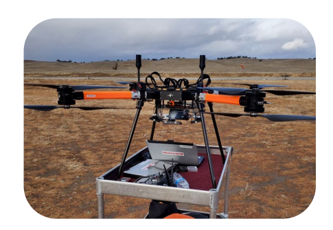
A-01: Honeywell's UAV performed several different trajectory shapes to test their performance without GPS.