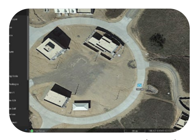
G-01: Yotta Navigation used an adhoc network to visualize CoT data on ATAK devices while deployed in the CACTF tunnels.