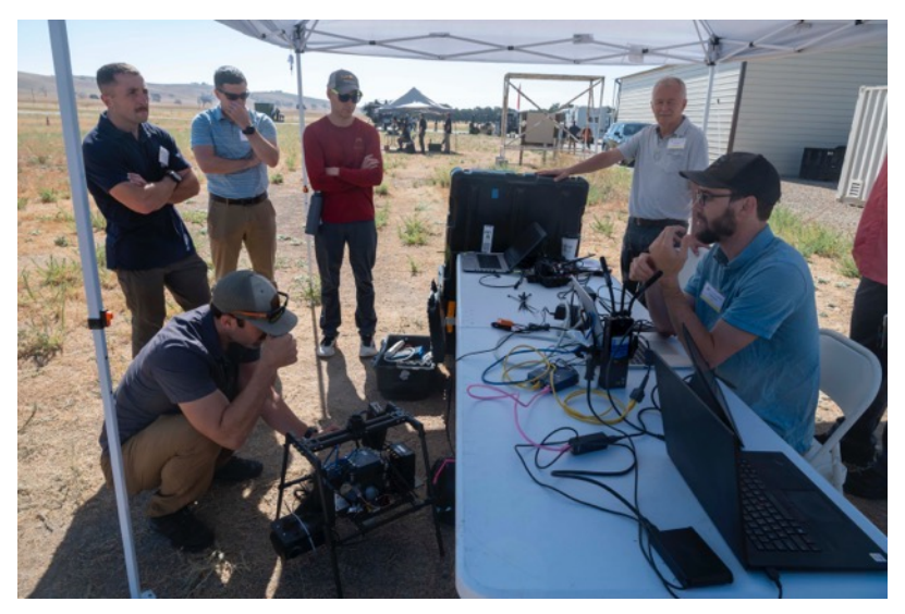
NPS students discuss the merits of a collaborative experiment combining <u>Vermeer</u> and <u>Trillium</u> capabilities to detect, track, and target objects in a GPS denied environment.

Twenty-three Naval Postgraduate School (NPS) information science students attended JIFX 23-4. JIFX is one component of NPS' mandate to enhance the technological literacy of military leaders. Events facilitate the exchange of ideas between NPS students, government stakeholders, and technologists from industry, academia, and government labs to advance the collective knowledge of defense applications for emerging technologies. Students assess technologies for their potential to solve operational challenges.