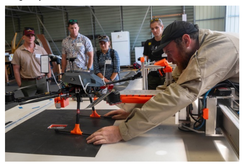
Naval Postgraduate School (NPS) students observe <u>Airrow</u>'s drone hub and discuss its operational applications.