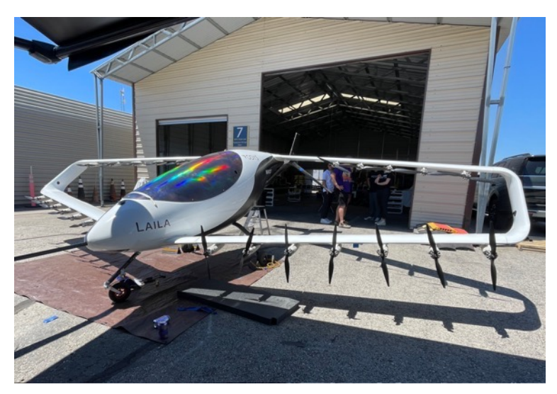
Odys Aviation validated the ability to transport and rapidly prepare, Laila, their twenty-one-foot box wing VTOL prototype aircraft from container to fully assembled in less than thirty minutes.