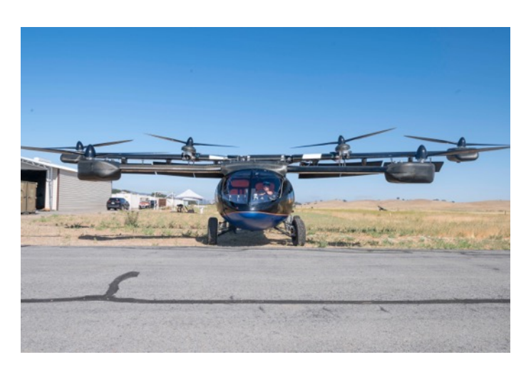
The ASKA team demonstrates how the wings open and close on their prototype A5, flying car. With wings folded the A5 is street legal.