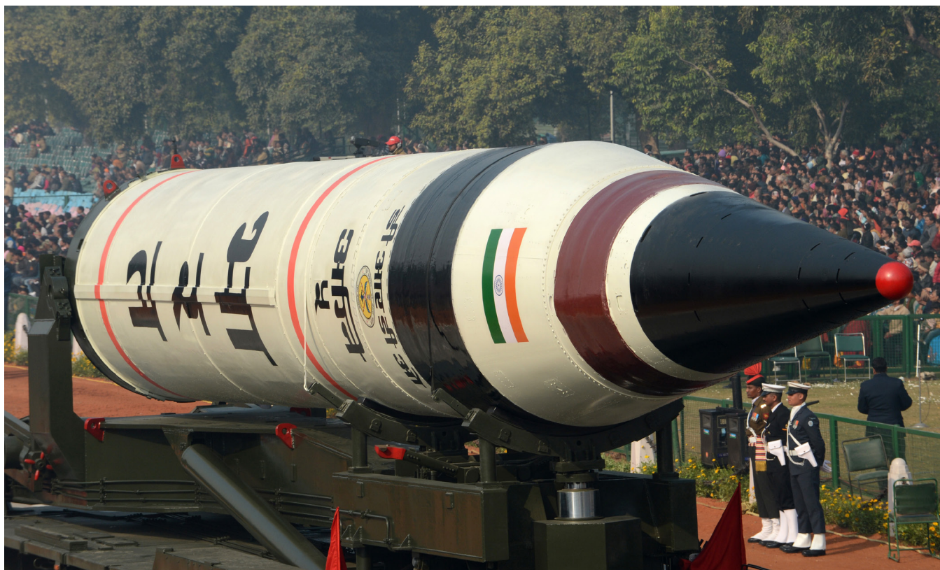
An Agni-5 missile is displayed on January 23, 2013, during a rehearsal for the Indian Republic Day parade in New Delhi three days later.

entry into the global nonproliferation regime: (1) developing political and technical criteria for membership into the regime; (2) engaging in bilateral negotiations with each of the two states on separate, independent tracks; and (3) partaking in multilateral negotiations and forums to reach an arrangement on strategic restraint. The end goal for these pathways, which are not mutually exclusive, is to allow the two countries to enter into export control regimes such as the Nuclear Suppliers Group (NSG) and the Missile Technology Control Regime (MTCR). Membership in global export control regimes will encourage Islamabad and New Delhi to negotiate bilateral steps toward nuclear stability, safety, and security as promised in the 1999 Lahore Declaration and avail themselves of opportunities for arms control agreements in a region in dire need of nuclear stability. 3