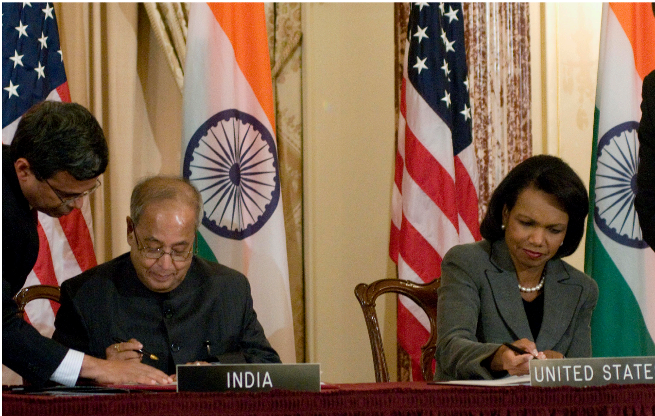
Indian External Affairs Minister Pranab Mukherjee (left) and U.S. Secretary of State Condoleezza Rice sign the U.S.-Indian nuclear agreement at the State Department on October 10, 2008, after the U.S. Congress approved the pact earlier in the month.

of the eligibility requirements, but may find it difficult to agree to all of the expected concessions due to the salience of nuclear weapons in their respective national security policies and the domestic political unpalatability of compromising too much of what each state might think is its “minimum credible deterrence” requirements. For example, the two states may still resist signing the Comprehensive Test Ban Treaty (CTBT) or ceasing production of fissile material for weapons. Furthermore, meeting the eligibility requirements alone is insufficient to attain membership in the club. Accession will require political negotiations with major powers and states that are members of the export control regimes, as each member state may have individual concerns that may preclude consensus even if India and Pakistan fulfill all the eligibility requirements. To gain international support for their formal entry into the NSG, the two countries would certainly be required to make concessions and accept restraints on their nuclear weapons programs.