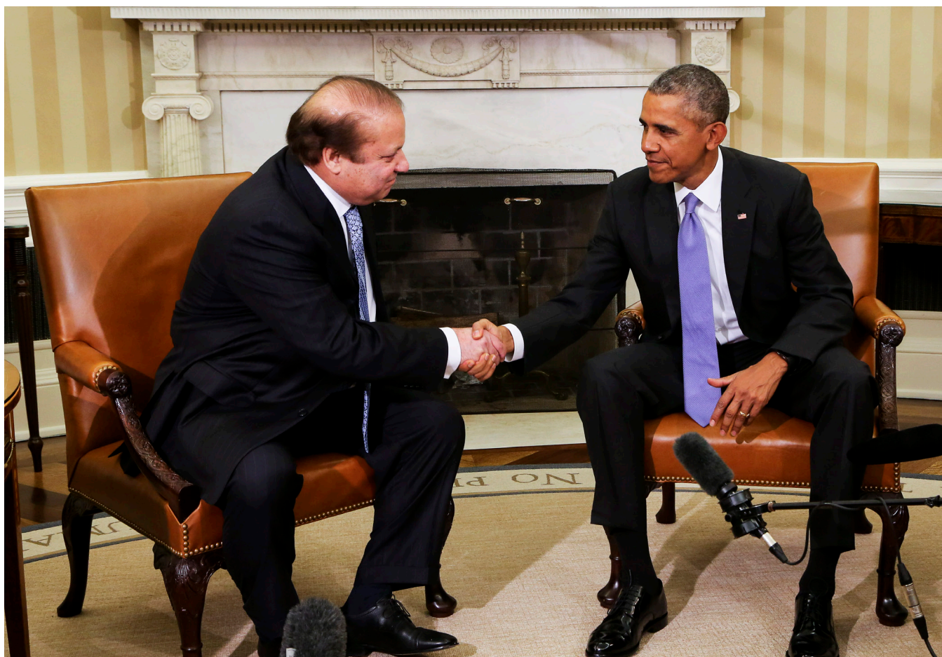
President Barack Obama meets with Pakistani Prime Minister Nawaz Sharif at the White House on October 22, 2015.

a bilateral nuclear deal can be struck with an outlier state through sustained diplomacy, patience, and political will.