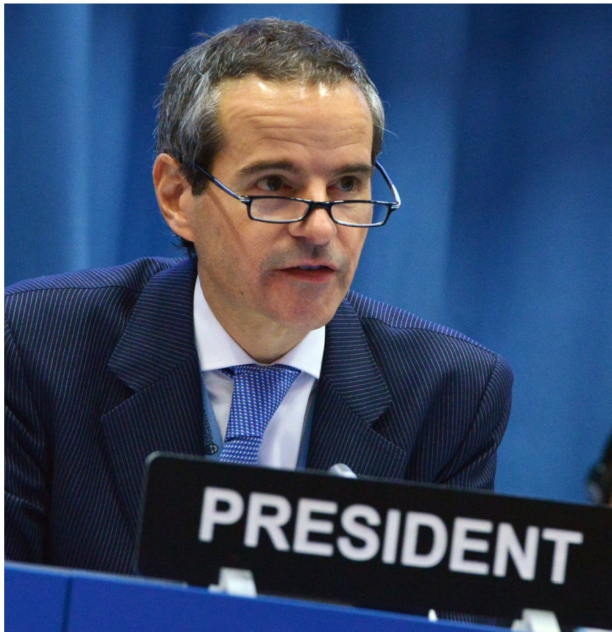
Rafael Mariano Grossi of Argentina, shown above in a February 2015 photo, currently chairs the Nuclear Suppliers Group.

to the simultaneous entry of India and Pakistan into the NSG. That model could be one way to break the gridlock surrounding Indian and Pakistani membership in the NSG.