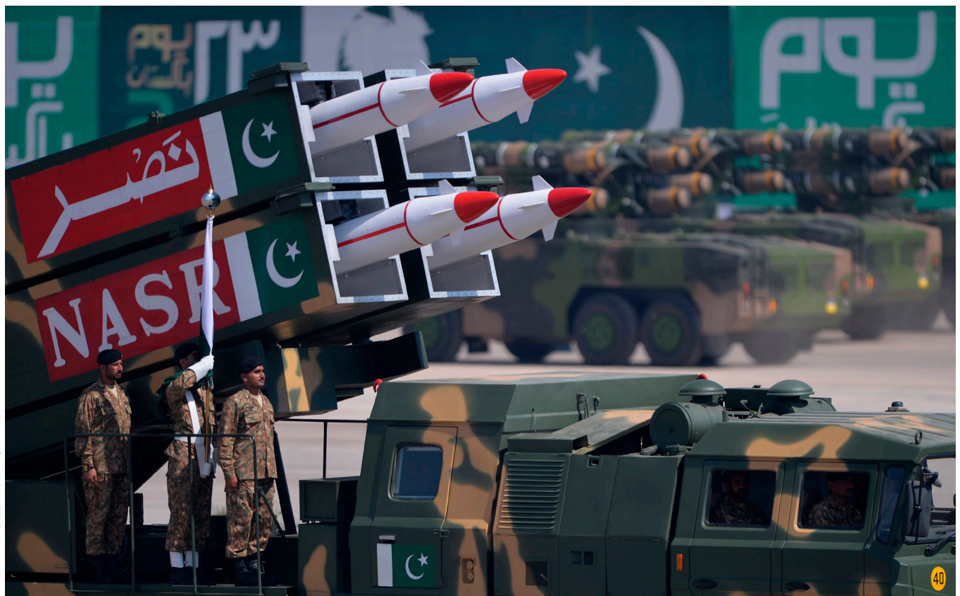
Pakistani military personnel stand beside Nasr missiles during the Pakistan Day military parade in Islamabad on March 23, 2015.