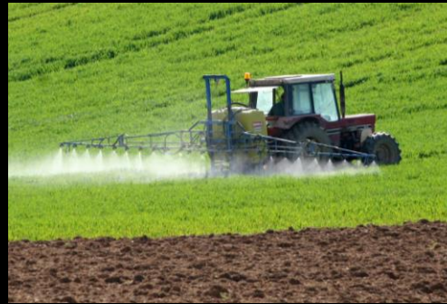
Tractor as a service