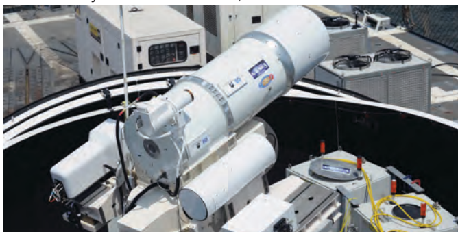
LAWS HAS BEEN TESTED AGAINST UAVS

Eccles said placing LaWS on the Ponce will involve fully integrating the weapon with the