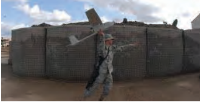
A SOLDIER LAUNCHES AEROVIRONMENT'S RAVEN.