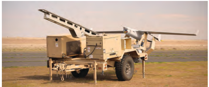
BOEING SUBSIDIARY INSITU'S INTEGRATOR READY FOR A LAUNCH.

"Some day in the near future you'll have a sailor controlling an Air Force unit's unmanned system, or an Airman sitting at a desk controlling a naval unmanned system or a Marine controlling an Army platform," he said in the release.