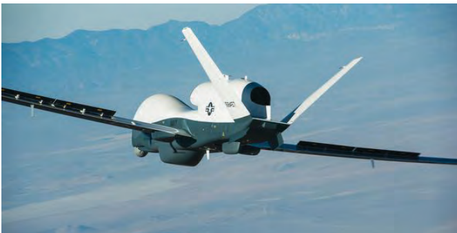
THE NAVY’S TRITON TAKES TO THE SKIES OVER CALIFORNIA’S DESERT.

The Navy’s MQ-4C Triton, a variant of the Air Force’s Global Hawk, took its maiden flight on May 22, the first of a series of tests to validate the aircraft designed for intelligence, reconnaissance and surveillance before it heads into production.