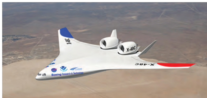
BOEING X-48C.

Boeing’s [BA] X-48C blended wing unmanned aerial vehicle (UAV) has successfully completed 30 test flights over an eight-month research period, the company said.