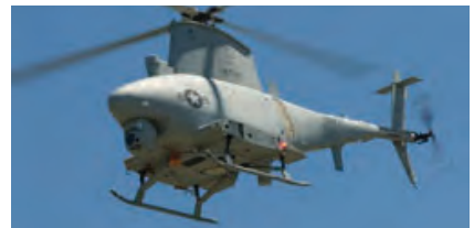
AN MQ-8B, A SMALLER VERSION OF FIRE SCOUT, IS ALREADY IN SERVICE.

The first MQ-8C is scheduled to deploy with the Navy in 2014. The Navy plans to purchase a total of 30 MQ-8Cs, according to Northrop Grumman.