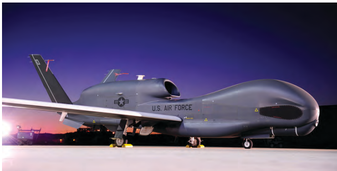
GLOBAL HAWK.