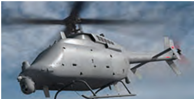
THE MQ-8C FIRE SCOUT UNDER PROCUREMENT FOR THE NAVY.

The Navy has ordered six of the latest Fire Scout unmanned helicopters that feature a larger airframe than those already deployed with the fleet are intended to fly and remain on station longer for intelligence, surveillance and reconnaissance missions.