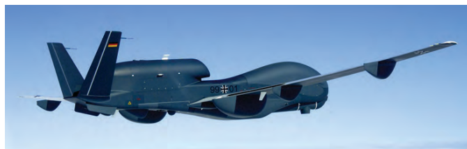
GERMANY SCRUBBED PLANS TO BUY EURO HAWK.

Germany has pulled the plug on plans to buy its version of the Global Hawk unmanned aerial vehicle.