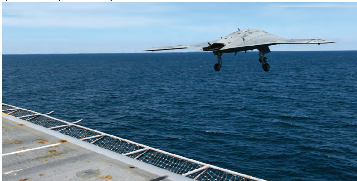
THE X-47B LIFTS OFF THE USS GEORGE H.W. BUSH.

The Navy made aviation history in May when the service conducted the first ever aircraft carrier-based catapult launch of an unmanned aerial vehicle.