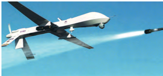
A PREDATOR FIRES A HELLFIRE MISSILE.

The Pentagon plans to cut spending on unmanned aerial vehicles in fiscal 2014 by one-third of the amount over the previous year, in part because of the winding down of operations in Afghanistan and the end of the U.S. military role in Iraq.