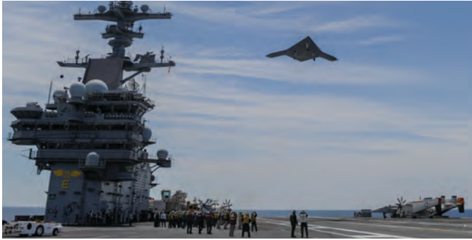
THE X-47B APPROACHES OVER THE AIRCRAFT CARRIER.