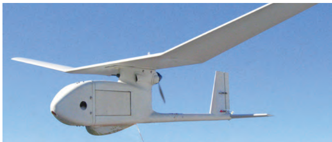
AEROVIRONMENT'S RAVEN.

The Federal Aviation Administration has issued a request for proposals (RFP) for six ranges that will be used to test unmanned aerial vehicles (UAVs) as part of the government's plan to integrate the technology into national airspace.