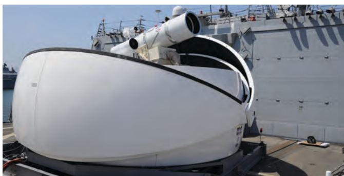
NAVY READYING TO DEPLOY THE LASER WEAPON SYSTEM (LAWS).

The Navy plans to deploy a solid-state laser on a ship early next year that has been successfully tested against unmanned aerial vehicles and could be used to counter threats in the Strait of Hormuz.