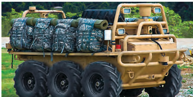
AN SMSS LOADED WITH RUCKSACKS.