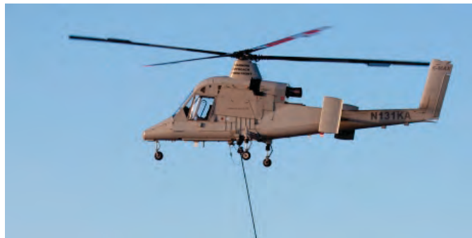
K-MAX FLIES AUTONOMOUSLY TO DELIVER CARGO TO REMOTE OUTPOSTS.

Since arriving in Afghanistan 18 months ago, the Marine Corps’ two K-MAX unmanned helicopters have earned high marks for their ability to deliver cargo in support of operations in remote areas, while putting fewer lives at risk by lessening the need for ground convoys vulnerable to roadside bombs or ambushes.