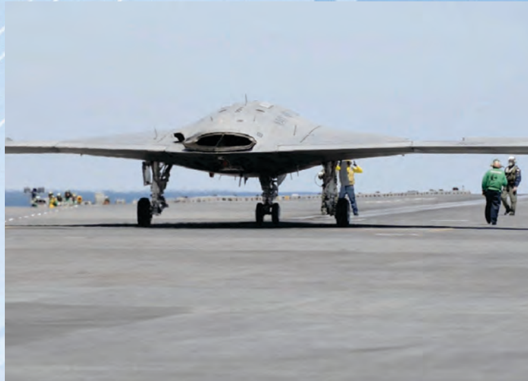
Video Credit to U.S. Navy