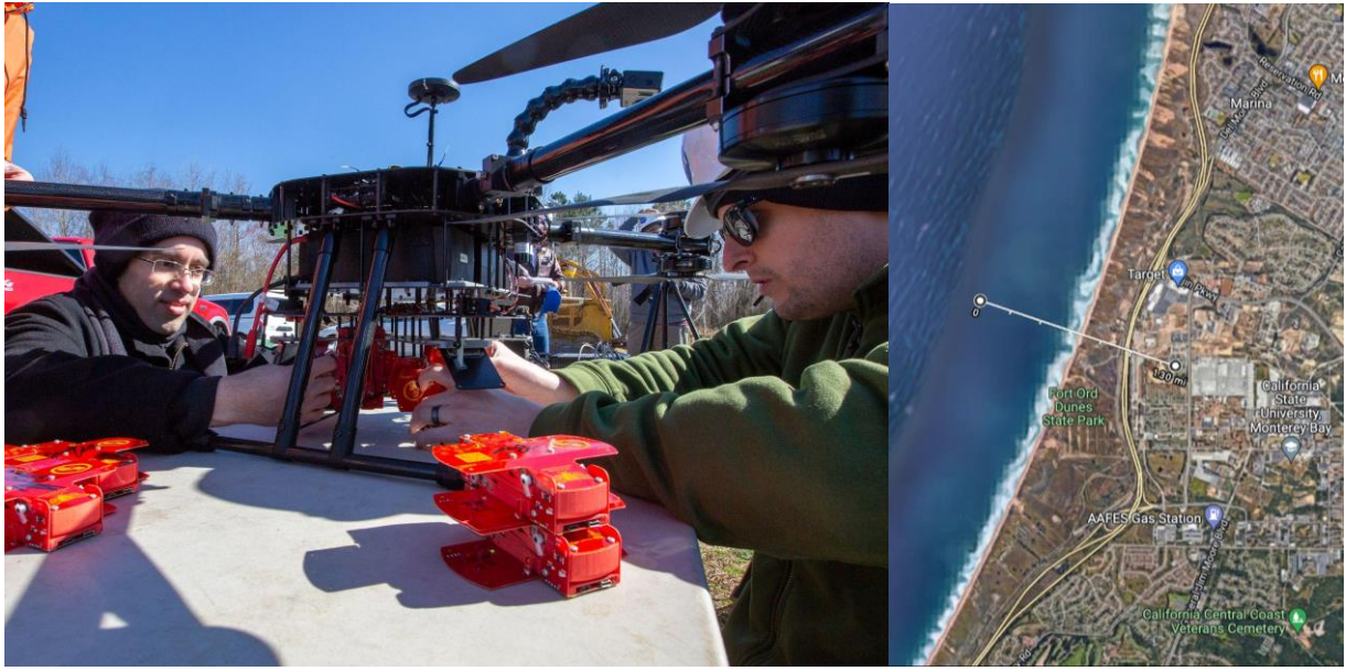
Figure 4: CICADA (Red Drones) and Deployment Drone<sup>42</sup>