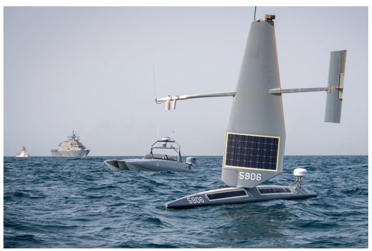
Figure 1 From left to right: U.S. Coast Guard cutter, littoral combat ship, Devil Ray T-38, and Saildrone Explorer in the Arabian Gulf on June 26, 2022.