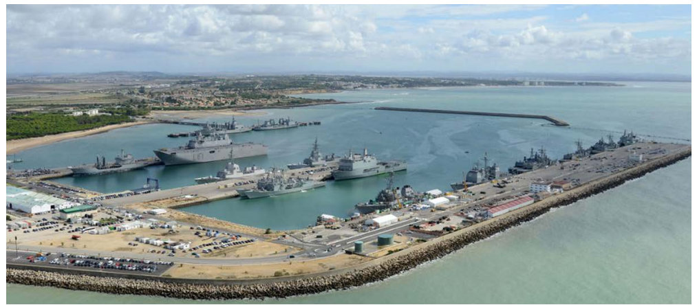
Naval Station Rota

The ERRE TTX was a valuable opportunity for participants to share their respective responsibilities, capabilities, and needs during a disruption. The exercise focused on response and recovery during a 72-hour base-wide outage caused by a lightning strike on the base power distribution feeders. Participants engaged in a series