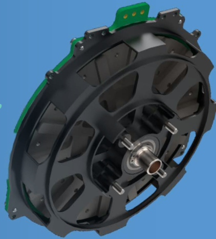
ECM propulsion motor for underwater vehicle